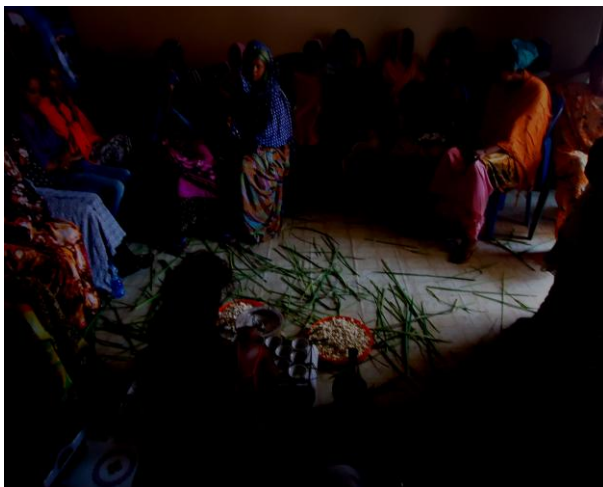
Coffee Ceremony at Jijiga

During this reporting period, 219 coffee ceremony sessions were conducted and 5242 female sex workers participated in the sessions. The same sex worker may participate in different sessions on different topics.