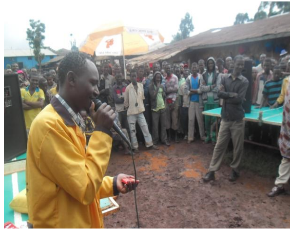
Event at Nekempte