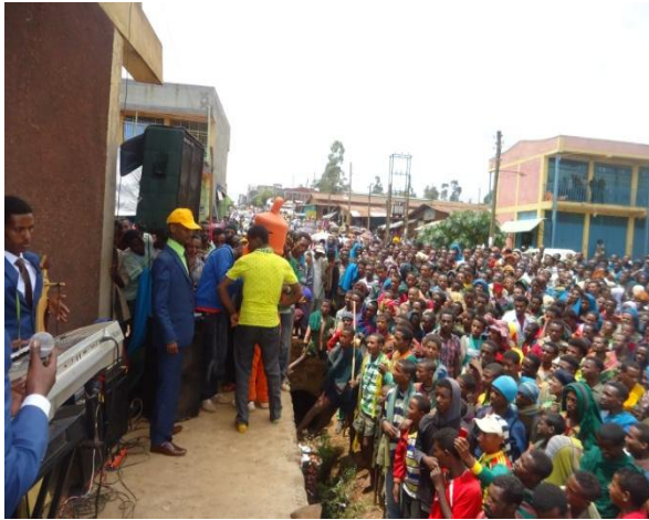
Event at Debre Markos