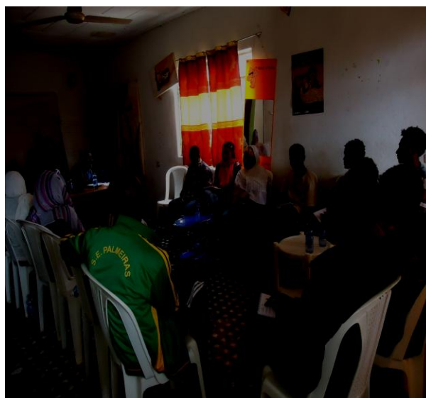
Training at Assosa

559 outreach activities were done in all the 32 DICs to recruit the sex workers and to visit happenings in hotels, bars and other sex work settings important for our work.