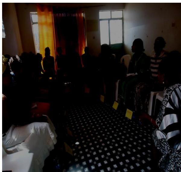
Training at Assosa