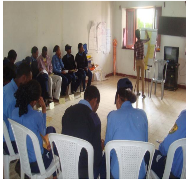
Workshop at Gondar