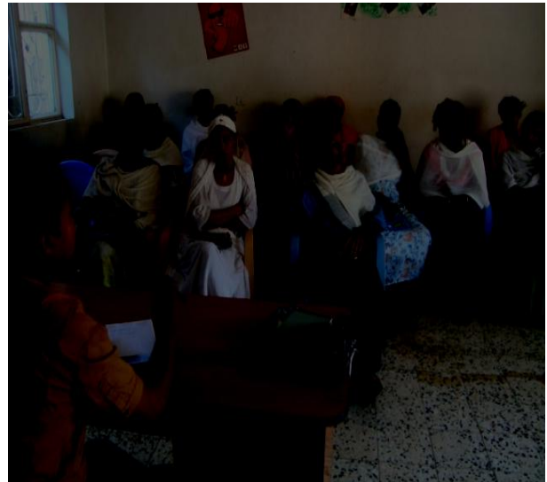
Workshop at Bahir Dar