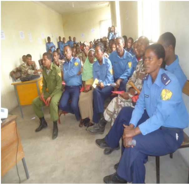
Workshop at Alamata