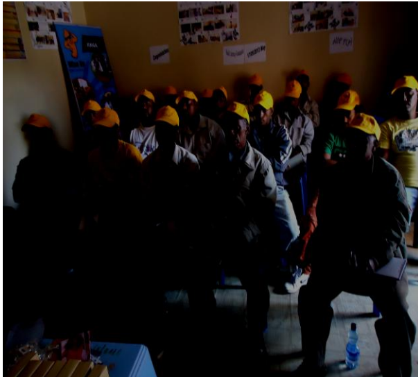
Workshop at Jigjiga