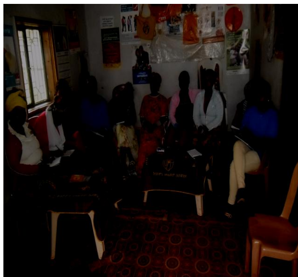
Training at Nekempte