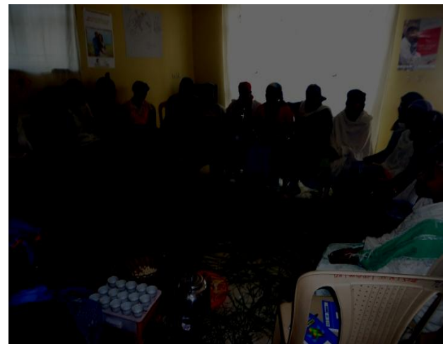
Coffee Ceremony at D/Markos